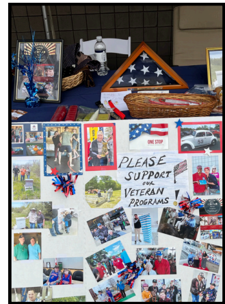
Honoring all veterans