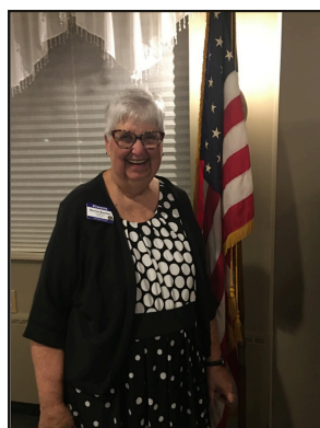
Lt. Governor Bonnie Barlett