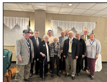
Hixon Award Recipients