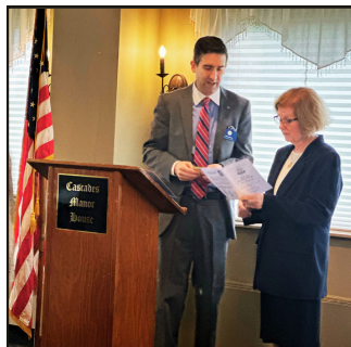
Passing the Torch