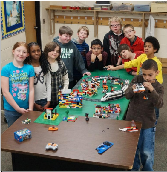
Proud students pose with their final Lego city.

Designing and building a Lego City. Teaching crochet. Reading to students. These were some of the projects Kiwanians were involved in with our partner, Bennett Elementary School this year.