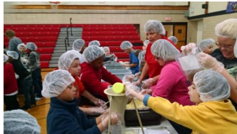
Kids Against Hunger 9,750 meals