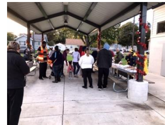
Ready to serve 600+ Trick or Treaters!