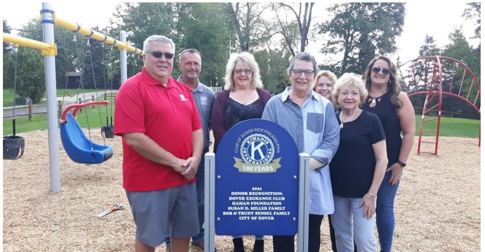
Members of the New Philadelphia Kiwanis Club pose with the new sign at the revamped play are at Dover Park's Deis Hill.

The Kiwanis Club is planning another special project, this one in New Philadelphia for 2022 and are working with city officials for guidance into what is needed. The group is already accepting donations and will have a pancake day in November to help support the project. Local officials from the City of Dover , City of New Philadelphia and Tuscarawas County Commissioners have proclaimed January 31 and February 1 as Kiwanis International Day in honor of the of the 100th anniversary of the Dover-New Philadelphia Kiwanis Club and the work they do for the community.