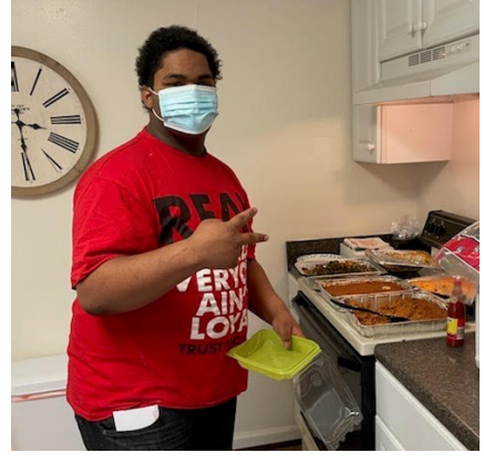
A resident of Kettering Commons prepares to enjoy the meal supplied by Kettering-Centerville Kiwanis Club.

The lunch was part of a continuing Kiwanis project benefiting families at this apartment complex. The club plans to provide Christmas stockings to children at the complex during December. Kettering Commons houses families that have previously stayed at St. Vincent's homeless shelters in Dayton.