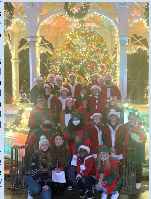
Carolers pause before the Medina City Gazebo before heading out to raise funds for a great cause.

A slideshow and videos highlighting the caroling can be found at https://www.medinakiwanis.org/