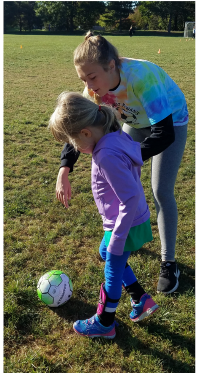
ONE OF OUR SOCCER BUDDIES MENTORS TEACHING A PARTICIPANT HOW TO DRIBBLE A SOCCER BALL

NOTE: THESE PHOTOS ARE 6 TO 7 YEARS OLD AND WERE TAKEN IN PUBLIC PARKS. ALL OF THE PARTICIPANTS HAVE 'GRADUATED' FROM OUR PROGRAMS.