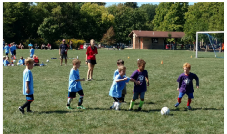
FIRST GRADERS PLAY IN THEIR FIRST EVER SOCCER GAME.

Since 1974 the number of participants in our program has risen and fallen. After only a few years, area middle schools began organizing teams for 7th and 8th graders and the club realized there was no longer the need to organize leagues for them. Around the same time we transitioned from a co-ed program to have separate leagues for boys and girls. The program has also transitioned from a spring only sport to a fall and spring program.