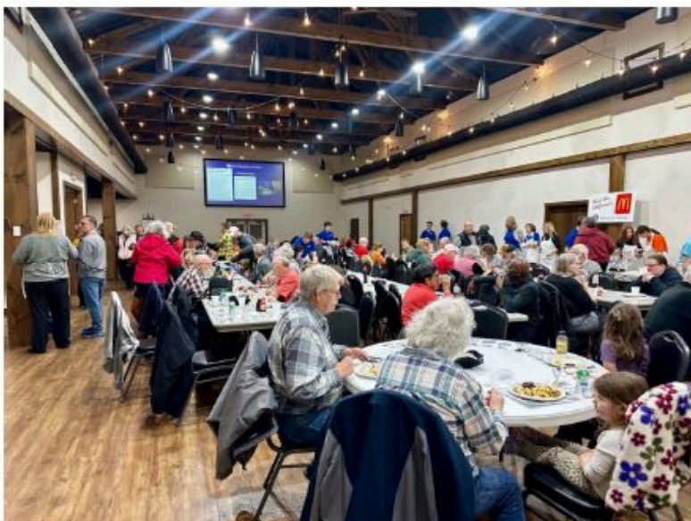
Attendees enjoy the food, country store and silent auction at the Marietta Kiwanis Club's 69th annual Pancake Days.