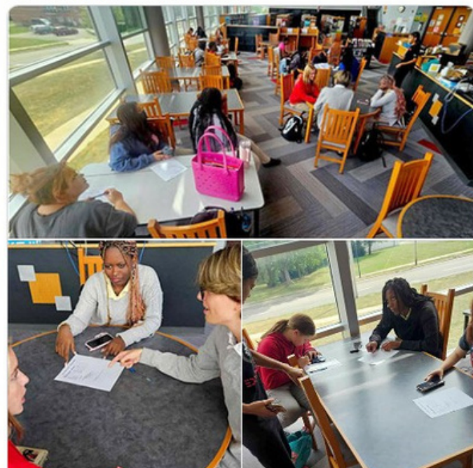
Lima City Schools August 27 at 3:45 PM · 🌐