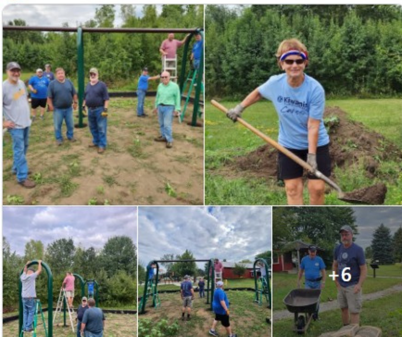
Kiwanis Club of Findlay August 24 at 9:34 AM · 🌐

Bruckdacher Memorial Park is getting something new - swings! Kiwanians spent Saturday morning setting the frame, keep an eye here for more progress updates coming soon!