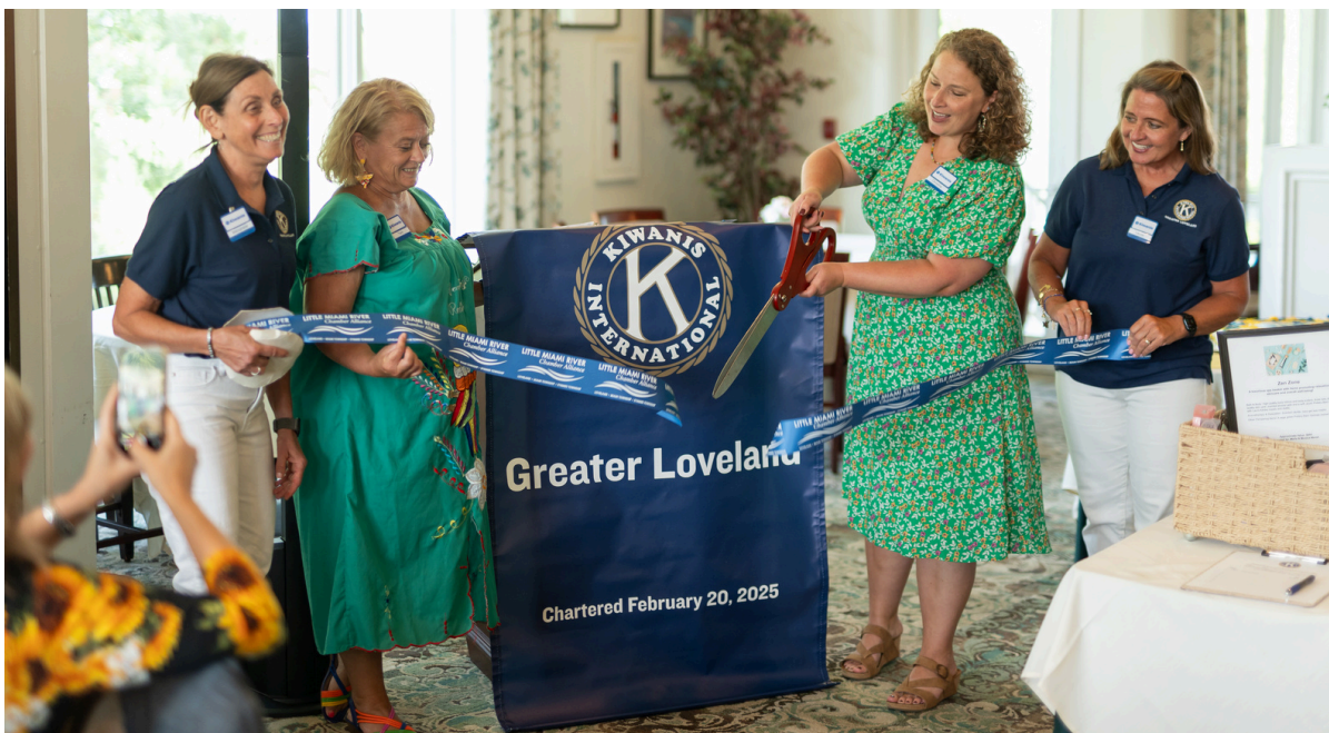
The Kiwanis Club of Greater Loveland held its charter party August 10.