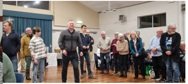
All up we had nearly 100 attending so not all tables shown here. The raffle table looked fabulous too thanks to Helen Blakebrough.