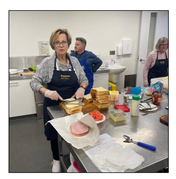
Catering at the Miniatures weekend