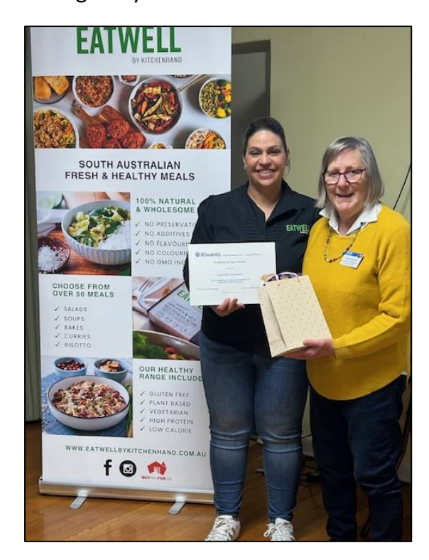
EatWell by Kitchenhand presentation

With four months to Christmas and my Presidency about to end at the Handover, once again I would like to thank all concerned for their support during the year.