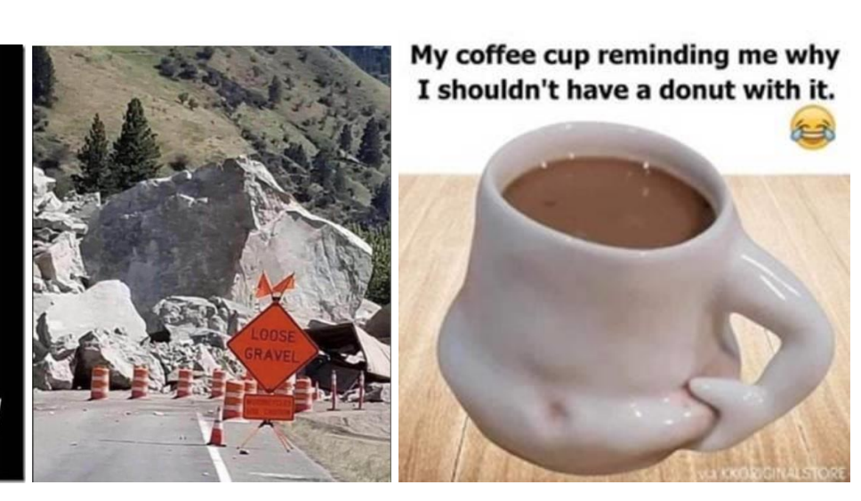
Sign says "Loose Gravel"!!