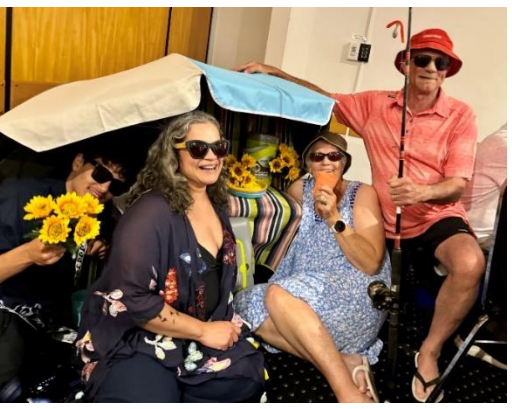
Aussie group at Beach theme Fun night