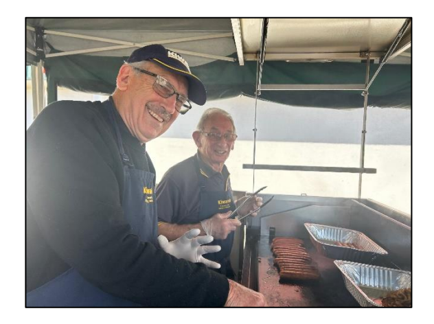
Hard at work at the Bunnings BBQ