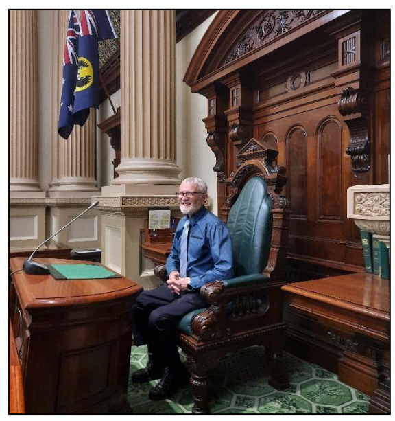
The new Speaker of the House!