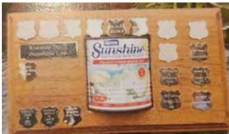
Left: The 'famed' Sunshine Cup being contested again at this year's Division 2 Mini Convention.