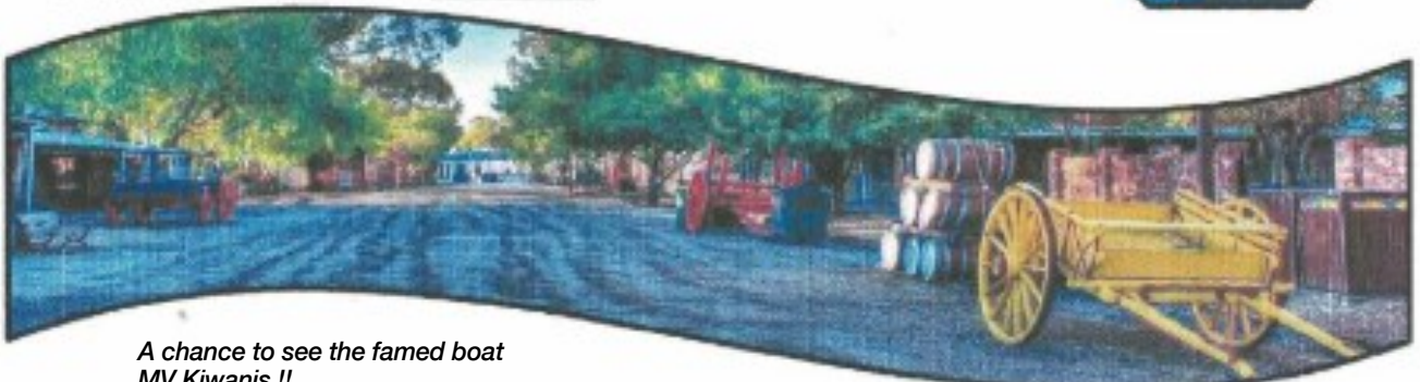
A chance to see the famed boat MV Kiwanis !!