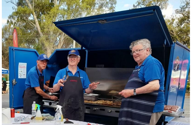
Angaston Christmas parade

Lutheran Care's distribution of Christmas hampers