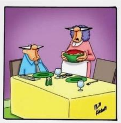
"I didn't want to waste the good stuff, so I used the oldest bottle in your wine collection for the spaghetti sauce."