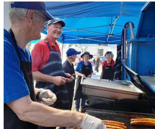
Air Show fundraising