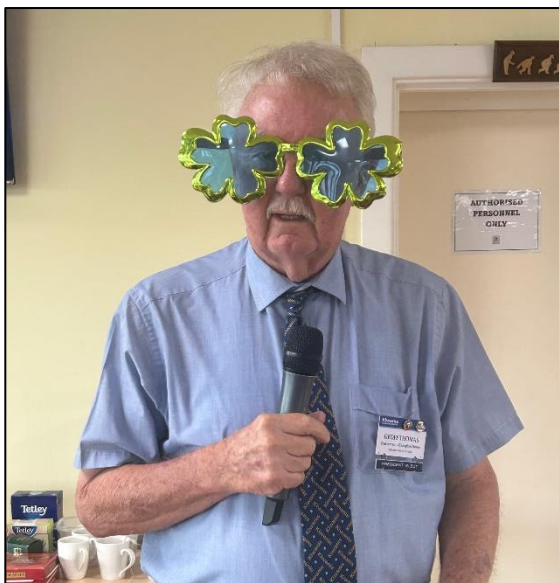
The first meeting of the year

In the past couple of months there has been significant activity around the club as you will be aware from the Directors Reports.