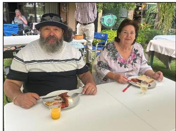
Kiwanis Annual Brunch