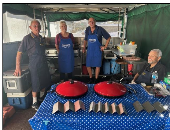
Bunnings BBQ workers - early shift!

Most people are shocked when they find out how bad I am as an electrician