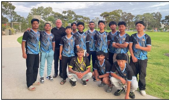
The Nepalese team were presented with guernseys provided by our club