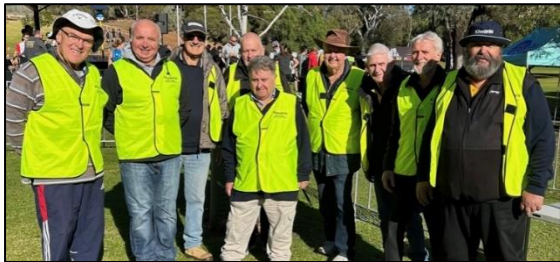
Double up fundraising day - Marshalling at Salisbury and Bunnings BBQ

Elsewhere in the bulletin you will see details of our fundraising activities. Sunday 25th May looms large in memories. Not one but two fundraising events took place. A wonderful response from members meant that over $3,000 was raised on that day.