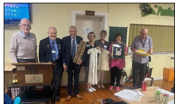
Antiques Road Show and Tell