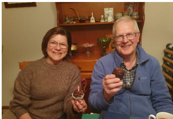
Birthday celebrations at the last Board meeting

Greetings and good health to all our members, especially those away travelling, cheers Des.