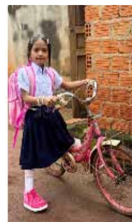
Khon, Miracle sMiles