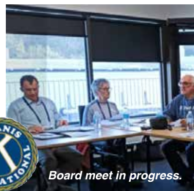
Board meet in progress.