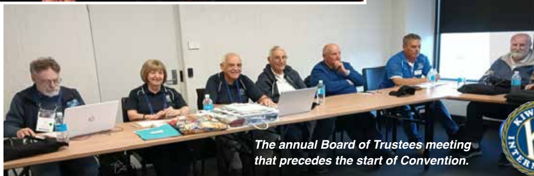
The annual Board of Trustees meeting that precedes the start of Convention.