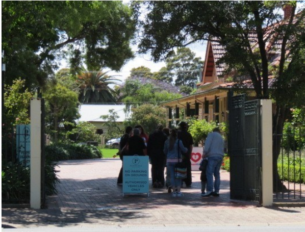
Above: the entrance to Partridge House, Glenelg

On 30 November we cooked the lunch for the HeartKids Christmas Party for children and families. This function was at the beautiful grounds of Partridge House at Glenelg. HeartKids themselves provided the food items and our people cooked it up. They did the serving. It was a fairly big job—thanks to all who volunteered on the day. We are always there to assist HeartKids in any way we can. The weather was quite good for this one, after predictions of loads of rain.