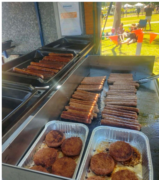
One side of our big trailer barbecue with the vegan options at the front