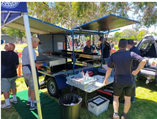
More photos from the day - fortunately we were able to change cooks from time to time to allow for a break on such a hot day