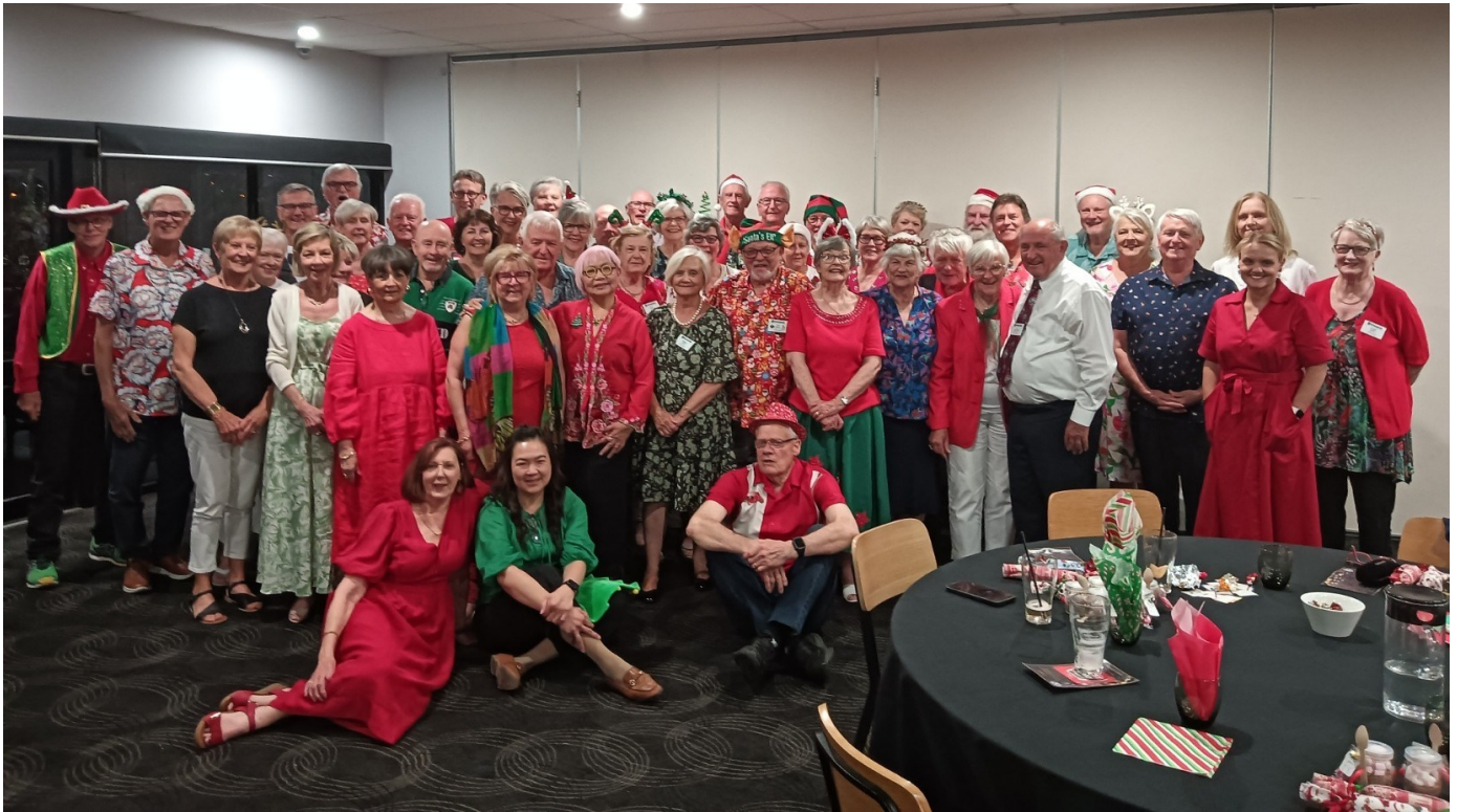
Above: a great photo of our fabulous club members who had some fun for Christmas after a wonderful year of volunteering to help children—thank you to all of you