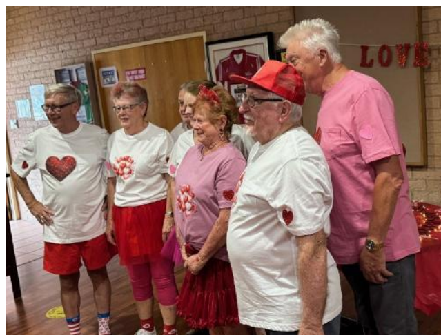
Brisbane Team dressed for "Love"

someone younger who knew all the music questions.