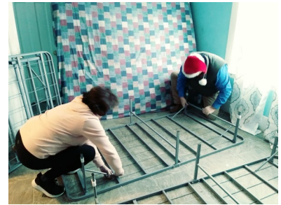
Putting the beds together