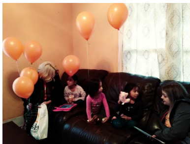
Ashley Home store with a few of the girls