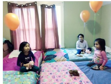
Three of the girls on their new beds