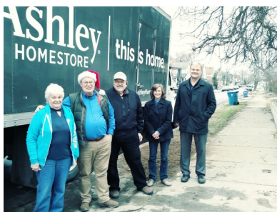
Grand Rapids Kiwanians

Thanks to everyone that helped to make this a truly Merry Christmas for this family.