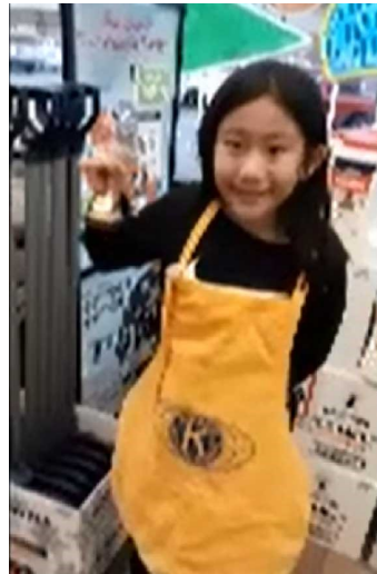
A granddaughter in action

It was time once again for our annual Salvation Army bell ringing for the Red Kettle Campaign. We moved inside this year to the Family Fair on Northland Drive. Thanks to all the Kiwanians and friends that participated. The total raised in the kettle was $654.