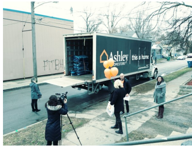
Media coverage unloading the truck