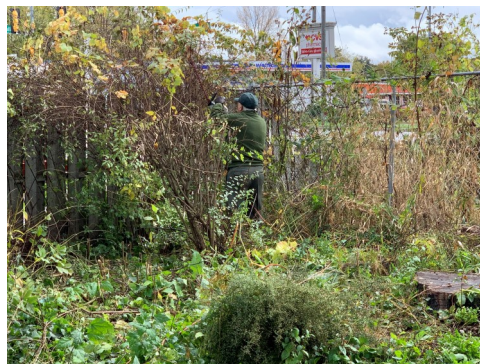
Trying to tame the jungle