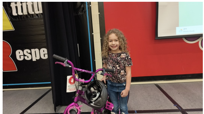
Coit Creative Arts Academy