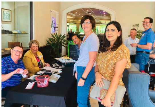
House and reception greeting members