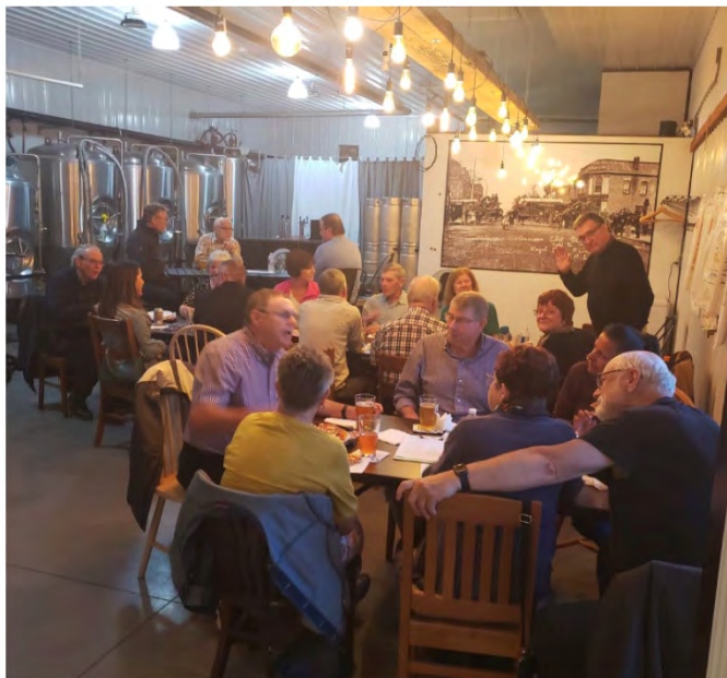
A wonderful and relaxing time was had by all

Following is a glimpse of an activity held by the Social Committee at the Steel Wheel Brewery this Friday 08-September