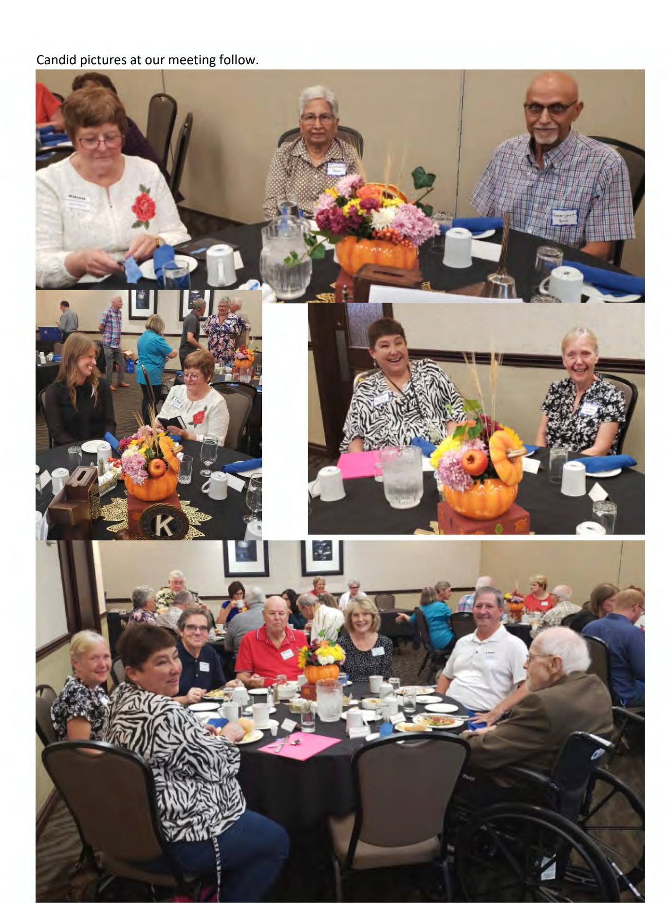
Page 6 of 8