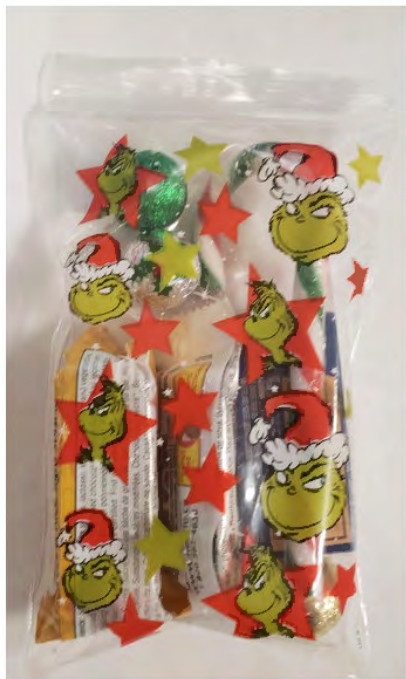
Grinch Candy Hand-outs