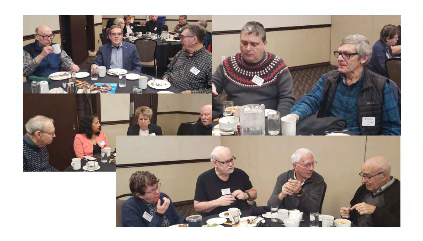
Following, are a few candid photos at the Saturday 25-January 2025, DCM in Waterloo