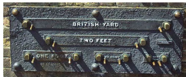
19th Century Greenwich Observatory Public Imperial measure standard