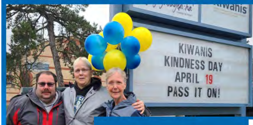
This year on Kiwanis Kindness Day, April 25 th , we are using our fundraising money to buy baby food for the Food Bank!