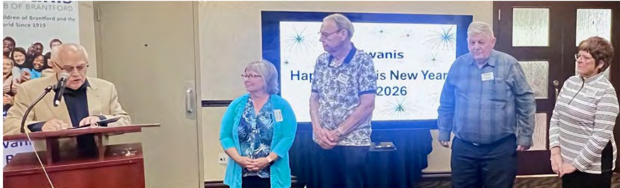
Following are the Executive for this year's Board