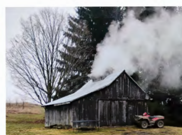
The Sugar Shack