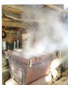
Old and more Current-boiling-off