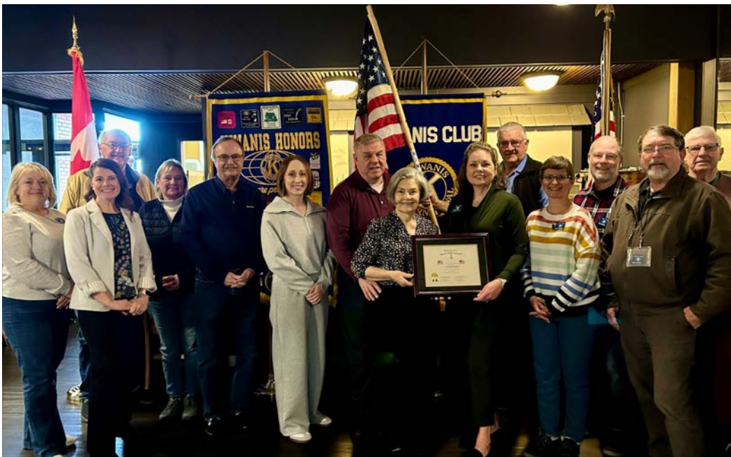
Ferndale Kiwanis Club being presented with the plaque.