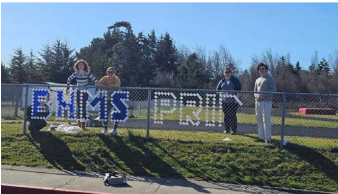
Students working on the new fence decoration cups donated by the PT Kiwanis Club.