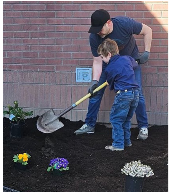
Volunteers planting flowers and shrubs in new garden area.