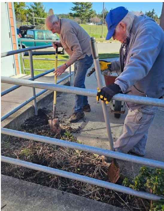
Kiwanian and Rotary members working on new garden area.