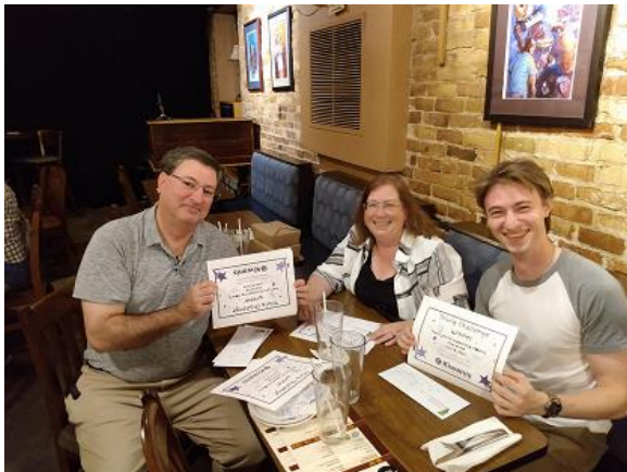
Second place team members