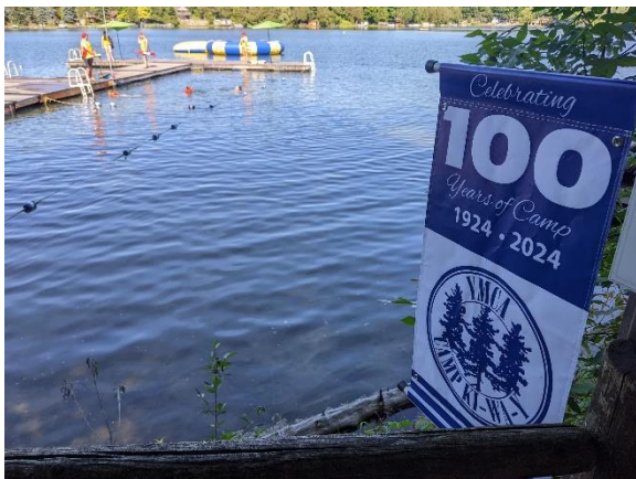
The waterfront at Camp Ki-Wa-Y

June 15 Morning leadership training took place at Karis in Waterloo. In the afternoon, alumni, friends, and K-W Kiwanians visited the YMCA camp Ki-Wa-Y for its 100 th anniversary in Clements Ontario.