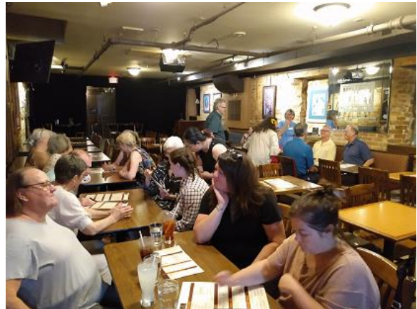
The Jazz Room Venue for Trivia Night was packed. The comprehensive Heather menu was available for dinner with a full bar.