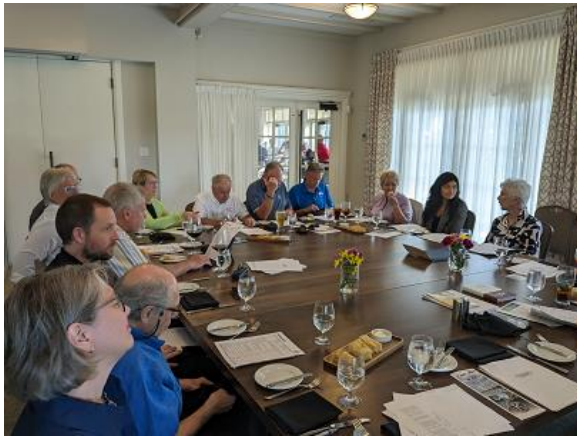
The K-W Kiwanis Board and guests at the Westmount Golf Club

June 4 The June Board meeting was held at Westmount Golf Club.