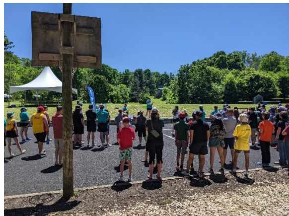
Celebrants at the 100 th anniversary of camp KI-WA-Y

June 18 K-W Kiwanis trivia night fundraiser was held at the Jazz Room on King Street in Waterloo.