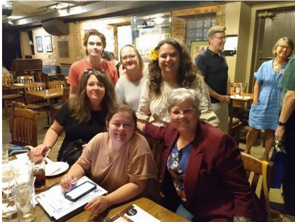
The first place team members

Top scoring team members received $25 gift cards and certificates for their performances.