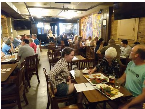
The long view to the front of the Jazz Room. Trivia rounds started just after dinner.