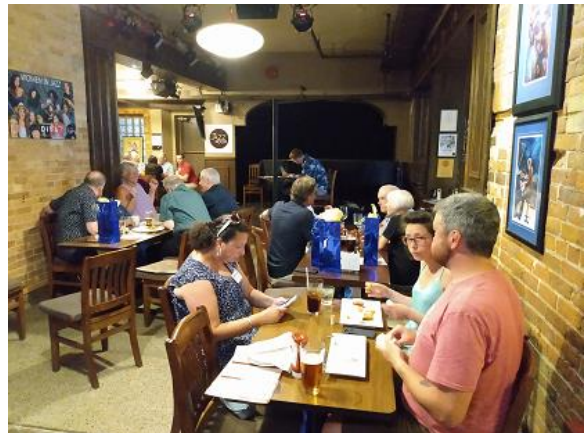
The alcove of the Jazz Room was filled with some of the club officers and long service honorees near the stage.