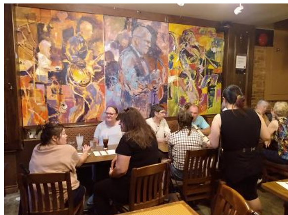
The Jazz Room Mural and busy wait staff

June 18 K-W Kiwanis trivia night fundraiser was held at the Jazz Room on King Street in Waterloo.