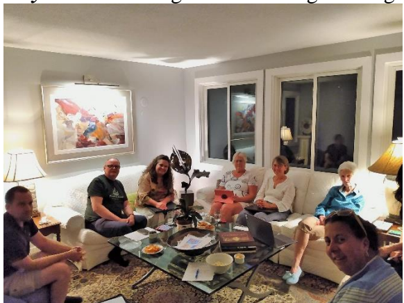
Funding & marketing committee members prepare for Kids' Day

July 30 Fundraising and Marketing meeting.