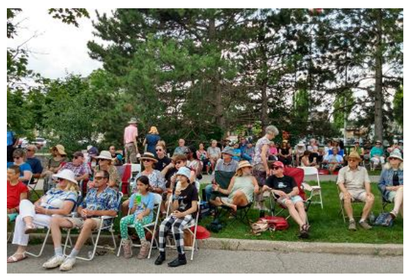
Attendance at the Jazz Festival was light in the afternoon but the square filled up every evening for the big name headliner groups.