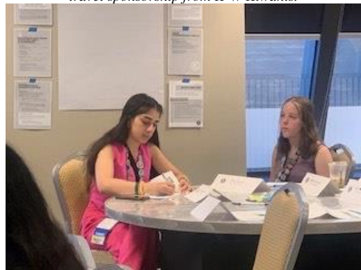
Heeva participated in the Global Leadership Certificate Masterclass.