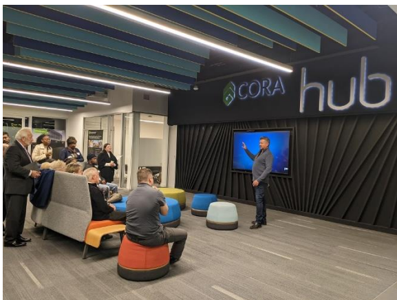
Introductory Presentation at EVOLV1

October 29 This month our club meeting was held at Canada's first zero carbon building Evolv1 in the Research & Technology Park of Waterloo. Attendees were treated to appetizers at 6:30 pm and a short tour of the facility at 7:00 pm.