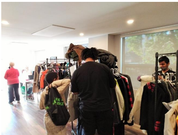
Customers scouring the racks for a good buy.

Over 200 coats were displayed on mobile roller racks. Following the month-long donation and collection period, the garments were inspected, selected, cleaned, repaired, and finally displayed for sale.