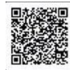
Scan QR code for advance tickets to the Jazz Room fundraiser.

Nov. 10 Music Education Fundraiser – 4:00-8:00 pm at the Jazz Room in Waterloo.