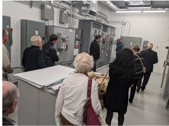
Kiwianians take the tour of the EVOLV1 zero carbon building