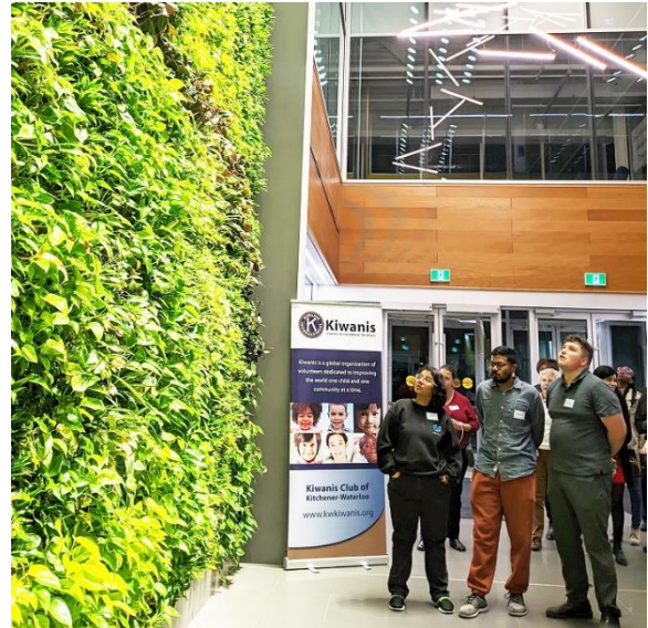
Attendees experience Canada's first zero carbon building Evolv1 in the Research & Technology Park of Waterloo.