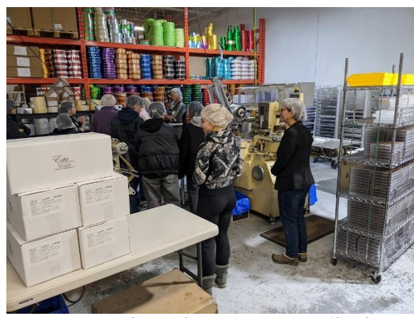
Kiwanians tour the manufacturing space at Esta Chocolates

Kiwanians got to see firsthand how it is all done. (Note: Esta chocolates can be ordered directly using the form available under "Forms" on our website kwkiwanis.org. Proceeds support Kiwanis community projects).