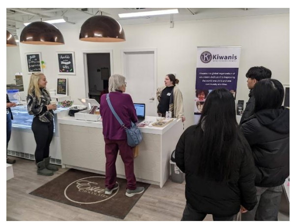
Circle K members gather around the main counter during the tour of Esta Chocolates in Kitchener.

Circle K International for college students: The University of Waterloo Circle K club runs service projects with the guidance of an approved Kiwanis advisor. Currently it has a roster of over two dozen members, some of whom like chocolate as much as our regular members! They turned up for the Jan. 21 tour of Esta Chocolates. Thanks for supporting local business Circle K.