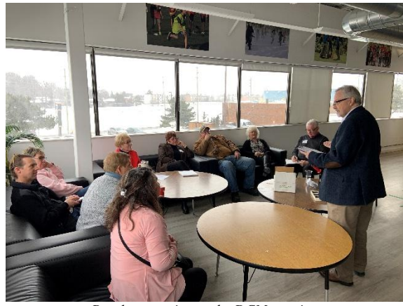
Breakout session at the DCM meeting

Breakout sessions rounded out the activities at the District Caucus meeting to bring everyone up to date on the latest guidelines from Kiwanis International.