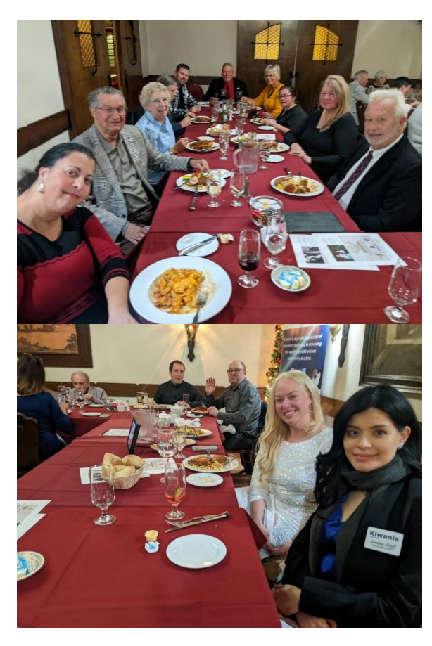
Dec. 24 Kiwanians were out in force at holiday time to deliver Meals on Wheels.