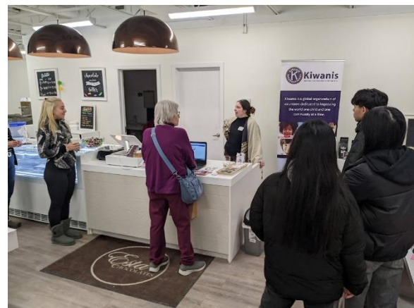
Circle K members gather around the main counter during the January 2025 tour of Esta Chocolates in Kitchener.

Circle K International (CKI) is the largest student-run volunteer organization of its kind, with over 12,600 members on over 500 campuses in 17 countries. CKI mirrors the mandate of Kiwanis at the university level in making our community a better place to live, through service, with a special emphasis on helping children.