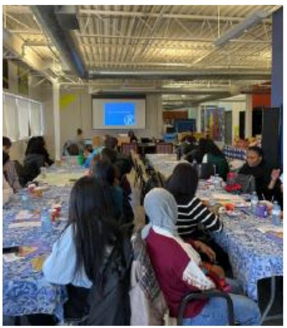
Circle K attendees at DCON 2025 in Waterloo

The agenda included workshops on fundraising, inspiring speakers from the Kiwanis Family, and District Board elections and concluded with recognition of outstanding clubs from across the province. In March, Circle K District Governor