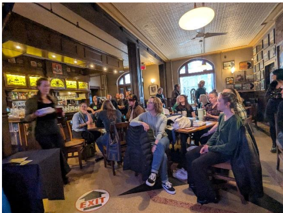
Inside the Jazz Room on King Street at the Kiwanis Celtic Cabaret

Mar. 16 A Celtic Cabaret at the Jazz Room replaced our usual club meeting this month.