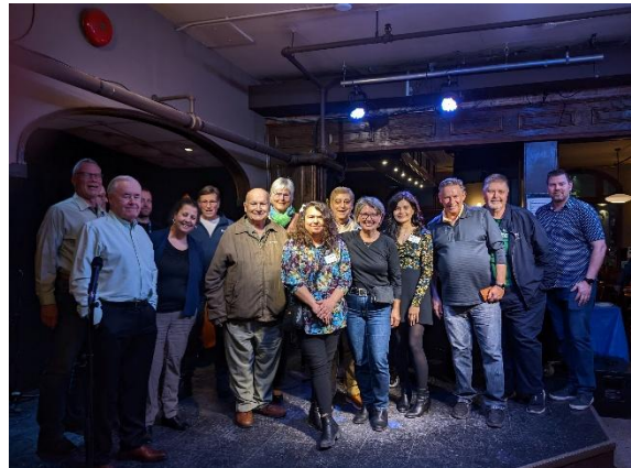
K-W Kiwanians gather on stage to celebrate Celtic Cabaret Night

After expenses, including printing, the club made $1013 at the event.