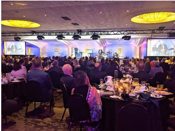
The venue for the new hospital fundraiser overflowed with patrons.

Mar. 31 The Rotary and Kiwanis clubs of Kitchener-Waterloo jointly undertook a gala fundraiser for a new hospital to advance healthcare in the Waterloo Region.