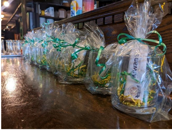
Baskets lined up for the basket draw at the Jazz Room