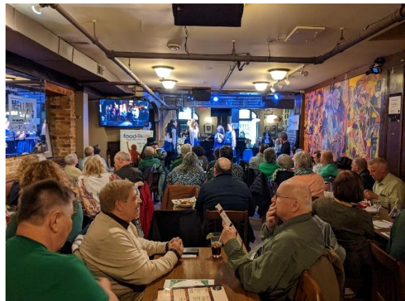
The house was packed with the St. Patrick's Day crowd.

In support of Food4Kids, a total of 72 tickets were pre-sold (60 on Eventbrite and 12 through e-transfer), while 5 people paid at the door. The 47 basket draw tickets netted revenue of $940 for our projects.