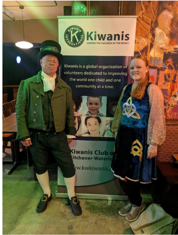
Attendees were greeted by a leprechaun and his assistant.