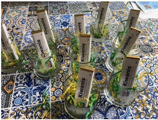
The basket draw provided Esta chocolates and a cash reward.