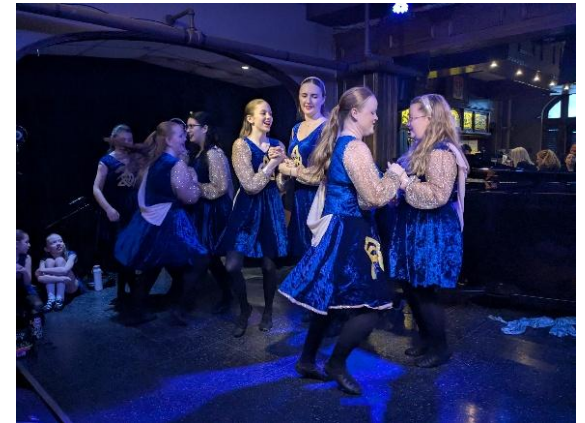
Intensely Irish Dancers performed live on stage at the Jazz Room.