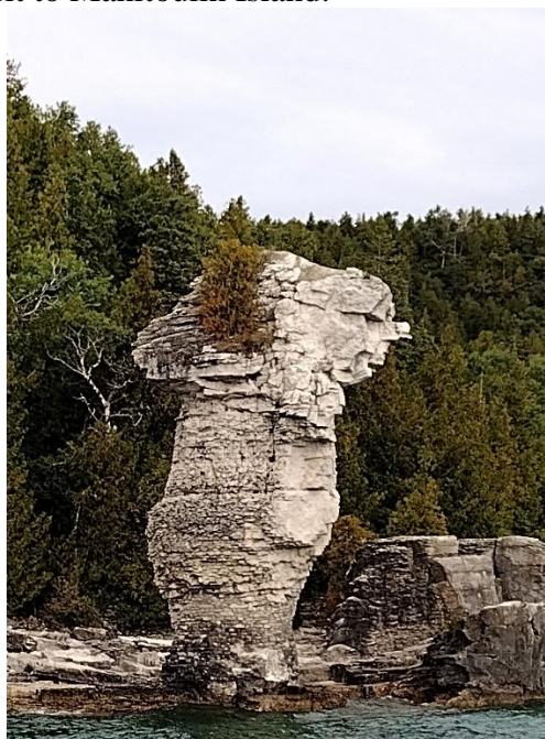
The largest "flowerpot" on Flowerpot Island

September 10 Kiwanis members Steve and Paula Rand sent us these pictures from Georgian Bay where they toured Flowerpot Island, the wrecks of Tobermory and caught the fall colours during a post-labour-day visit to Manitoulin Island.