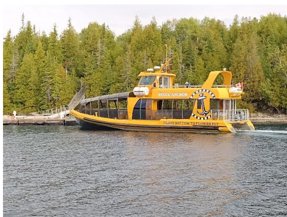
Touring the wrecks of Tobermory aboard the glass-bottomed boat

September 11 Bingo night at the K-W Gaming Centre brought in much needed revenue for our academic bursary program. September 16 The President's annual planning meeting: Board members met at Westmount Golf & Country Club to socialize, have dinner, and review the club's successes for the year while planning for 2026.