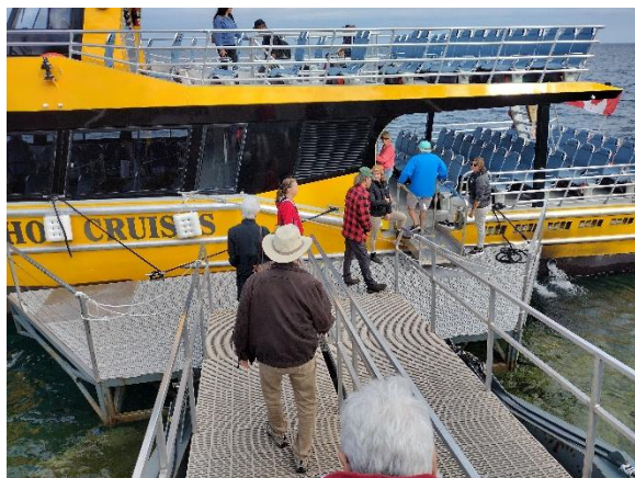
Boarding for a late season trip to Flowerpot Island