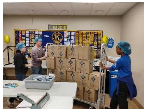
Boxes of sealed meals are stored by Coalition for Food staffers, awaiting shipment to meet emergencies worldwide.