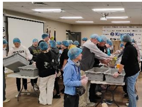
Each pouch sealed in the assembly line feeds six people with rice, vegetables and protein when combined with six cups of water.