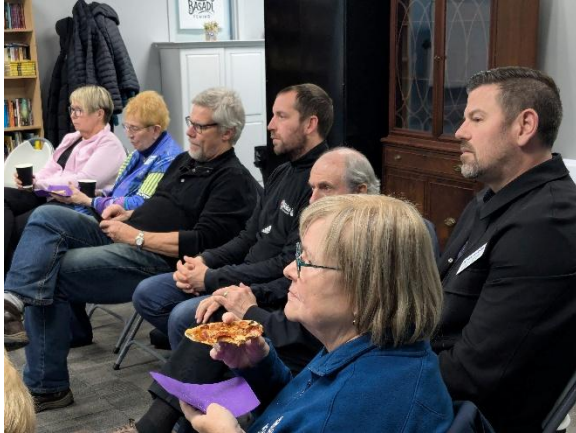
Interclub attendees listen to Key Leader Program updates.

November 18 This month an interclub meeting was held at Adventure4Change (465 Phillip Street Waterloo) to review outcomes of the Key Leadership Camp.