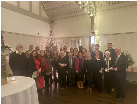
Group shot of the K-W Kiwanis Club with mayor Dorothy McCabe in the Westmount GCC ballroom.