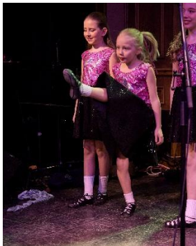
Both the Intensely Irish Dance and Kaleidoscope Irish Dance & Movement troupes kicked up their heels for the crowd.