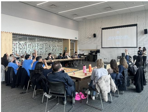
The Eastern Canada District Convention (DCON 2026) was held March 8 at the University of Waterloo. This conference provides annual leadership training for Circle K club members.