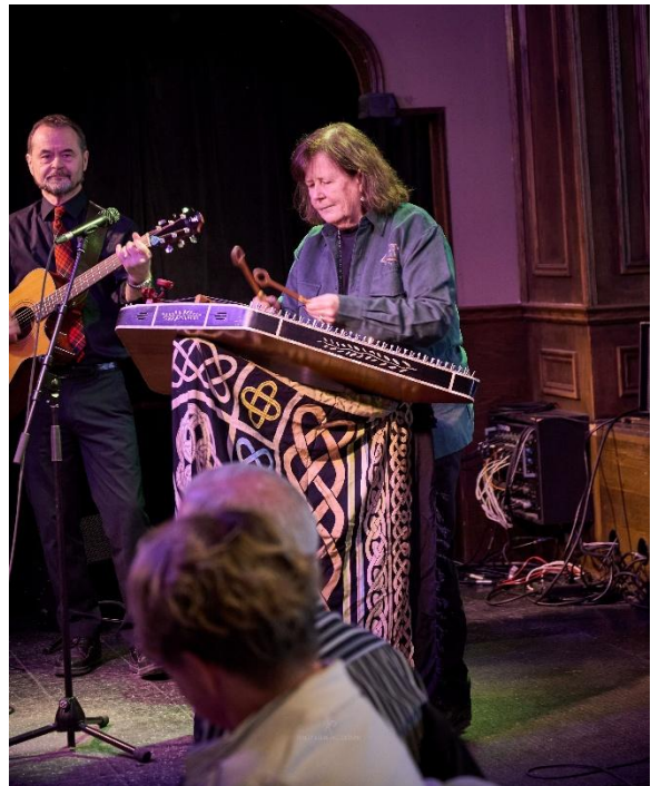
The Traditional Celtic Music Group of Elmira entertained with mandolins, hammered dulcimer, numerous fiddles, and guitars.