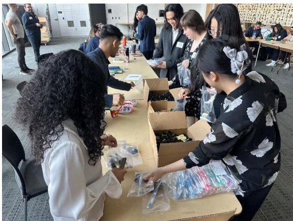
DCON 2026 attendees participated in training exercises and a community service project to welcome immigrants to Canada.

This month's DELC 2026 conference provided current and former K-W Key Clubbers with leadership training. Last month DCON 2026 provided similar training for Circle K Club members.