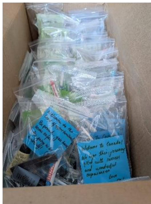
Conferees prepared welcome packets to be donated at Reception House in Kitchener to new arrivals to Canada.

CKI is the largest student-run volunteer organization of its kind, with over 12,600 members on over 500 campuses in 17 countries. However, more locally, K-W Kiwanis is especially proud of our up-and-coming group of civic leaders at the University of Waterloo.