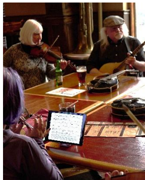
Musicians tune up at the Jazz Room for Celtic Cabaret 2026.

Celtic Cabaret was sponsored by Harbour Concepts. Proceeds went to Food4Kids. Thank you again Harbour Concepts!