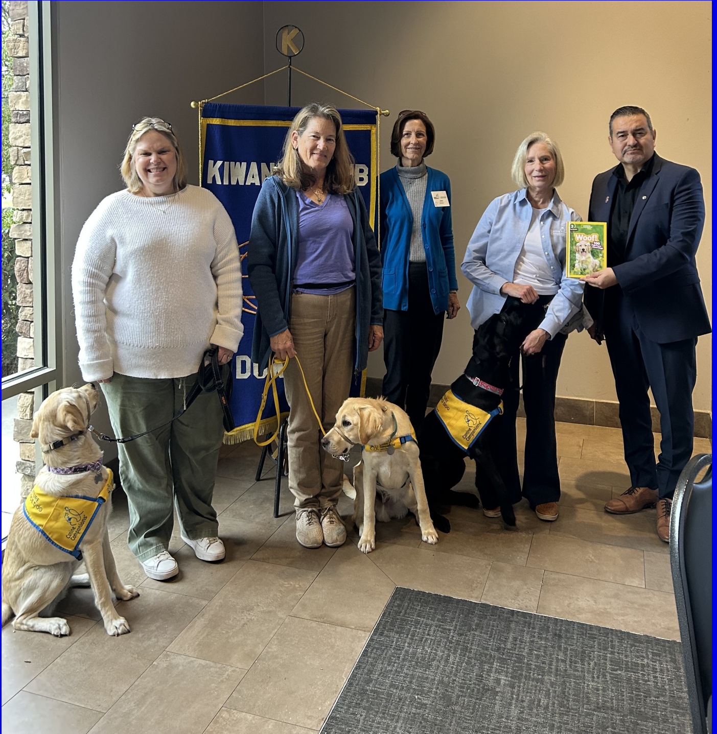
Canine Companion representatives and their puppies presented the program at our club's noon meeting on January 30th.