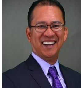
Pres-Elect Phil Requejo