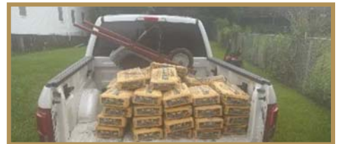
Cement for weight making