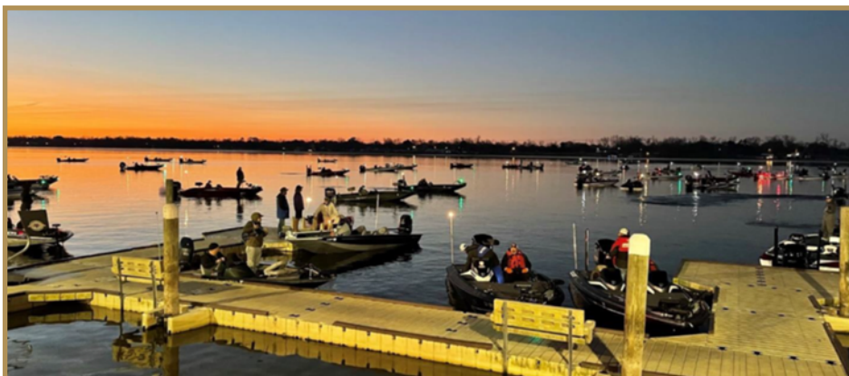
Pre-launch on False River at Kiwanis Tournament 2022