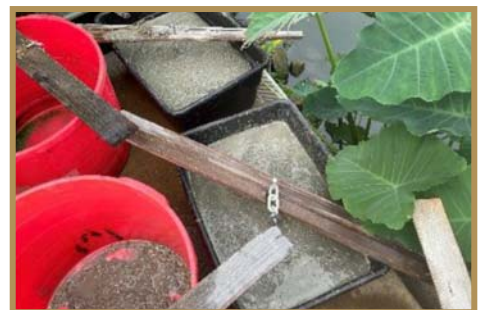
Molds with chains for later attachment of buoys