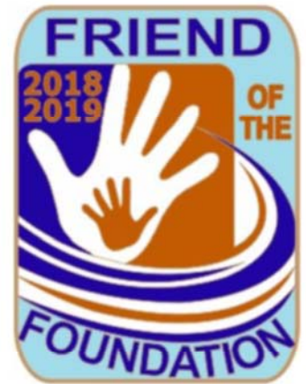
Sample of lapel pin