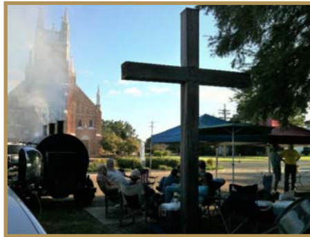
Cooking chicken dinners at St Mary's Kiwanis Park early one morning

In the 1990's, tournament attendance waned as False River began to experience water quality problems and deteriorating fish habitat. After some study by the biologists at the Louisiana Department of Wildlife and Fisheries it