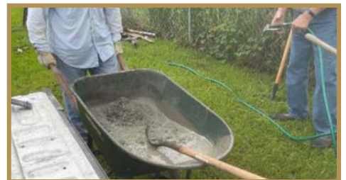
Ready to pour