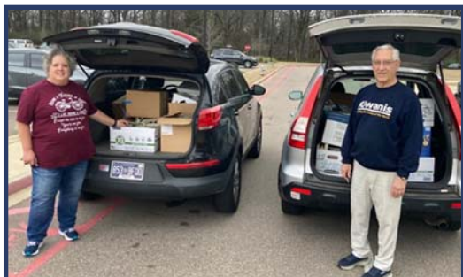
Books collected by Forest Hill Irene Elementary School K-Kids for schools in East Tennessee that do not have libraries