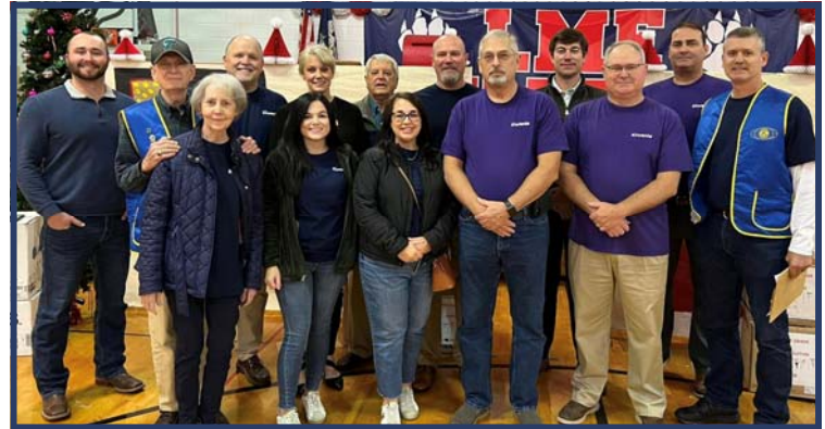
Members of the Pineville Kiwanis Club

In December, the Pineville Kiwanis Club, with the assistance of the Alexandria Kiwanis Club and Pineville High School Key Club, hosted the club's first coat drive for Pre-K through third-grade students at Lessie Moore Elementary School in Pineville, Louisiana. The clubs distributed 400 coats to the students.