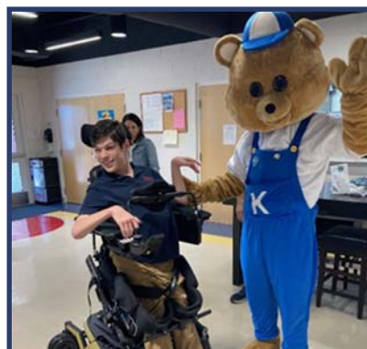
K-Bear at the Madonna Learning Terrific Kids Program