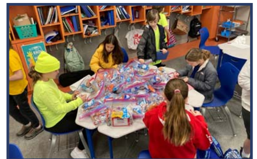
K-Kids preparing appreciation goodies for school support staff