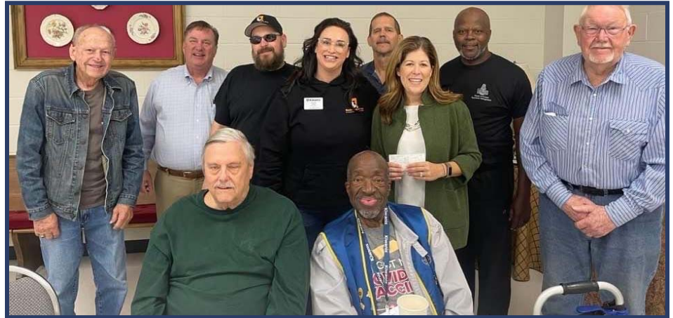
Millington Kiwanis Club members present Millington Hope House with $500.