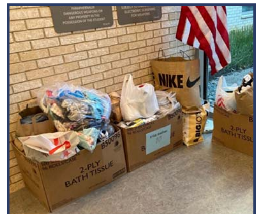
Clothing for the homeless collected by K-Kids