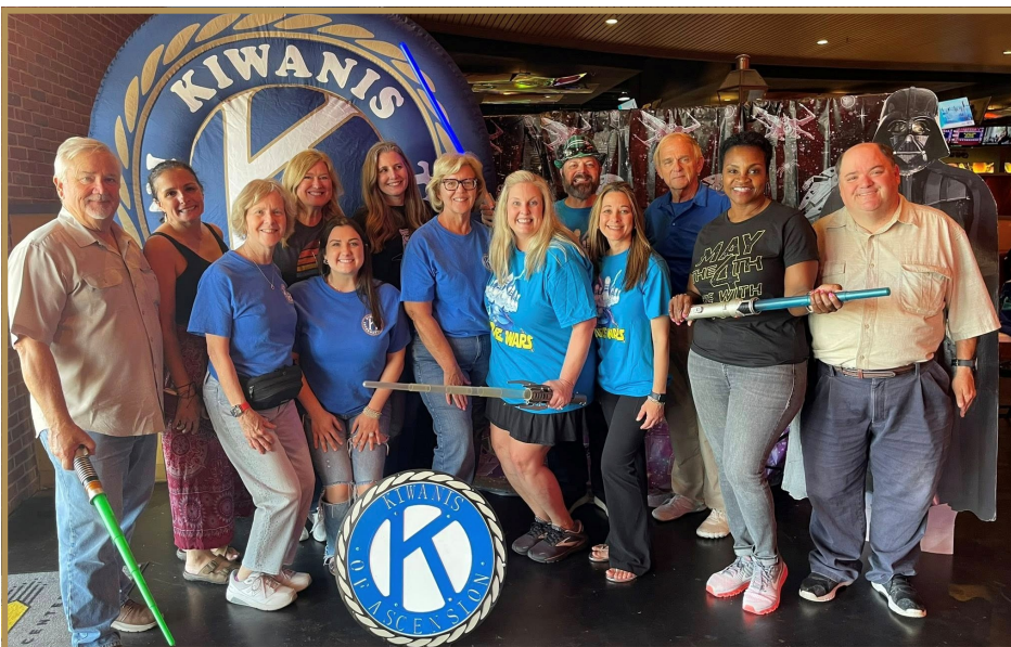
Ascension Kiwanis Club members