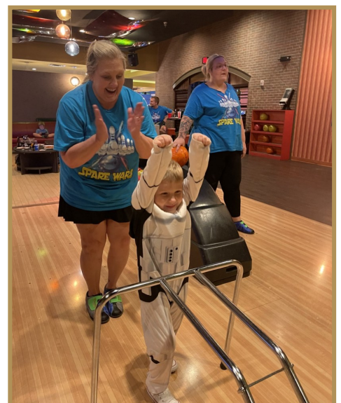
And that's a strike for the Storm Trooper!